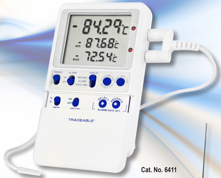
Cat. No. 6411