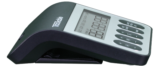
Stable angled design allows easy setting and viewing without having to hold the timer